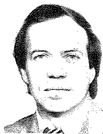
Dr. James Hansen.

While detection of a "global greenhouse signal" is only a first step in analysis, Hansen concluded that global warming has reached a level at which a cause-and-effect relationship can be inferred.