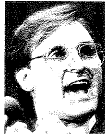
Ambassador Stephen Lewis.